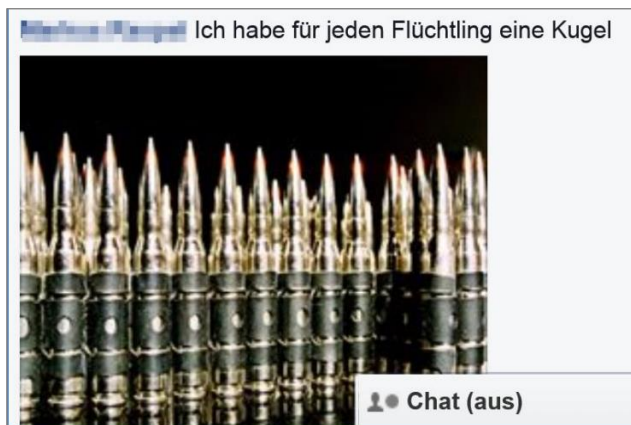
Openly expressed threat of violence against refugees in a Facebook post "I have a bullet for every refugee". (Source: Facebook; Original not pixelated)